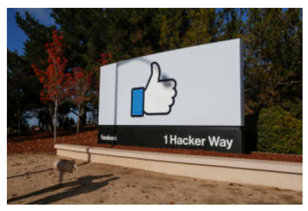
Facebook, photographed in Menlo Park, Calif., on Friday, Dec. 11, 2015.

The current crop of tech giants also command handsome profits, in contrast to long-gone tech upstarts such as Webvan and <u>Pets.com</u>, which vanished after their business models collapsed.